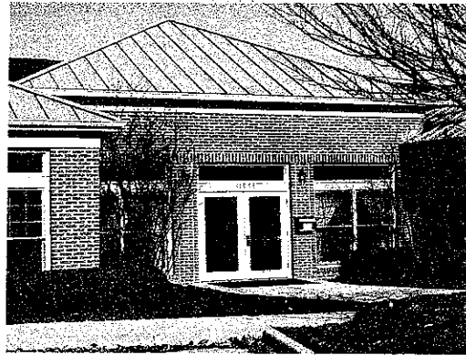
Main entrance to the Community Building

Edgewater's Annual Holiday Party is Friday, December 5th @ 7:30 p.m. , in the Community Center by the swimming pool. Please bring a dish to share with your neighbors. We hope you can come out and spread some holiday cheer to your neighbors!